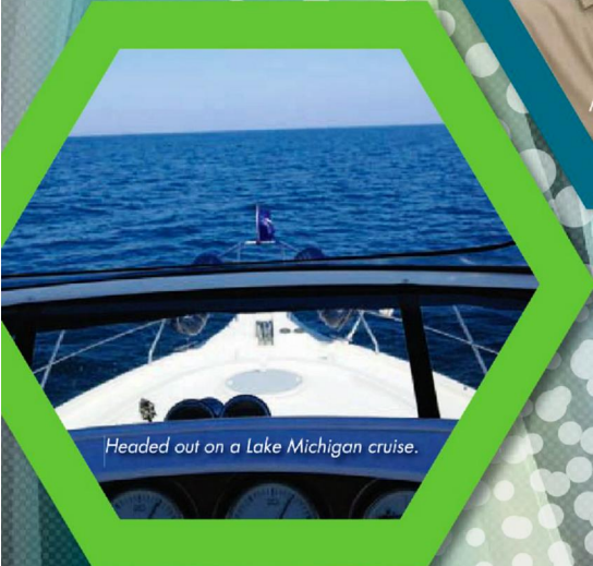
Headed out on a Lake Michigan cruise.

He loved personally welcoming new members when he served on the Red Carpet Welcome Crew, a job well suited for such an affable person. Currently, he serves as Co-Chair of the Member Retention Committee and enjoys finding new ways to connect members, provide new valuable tools to membership and help plan engaging regional networking events through out year.