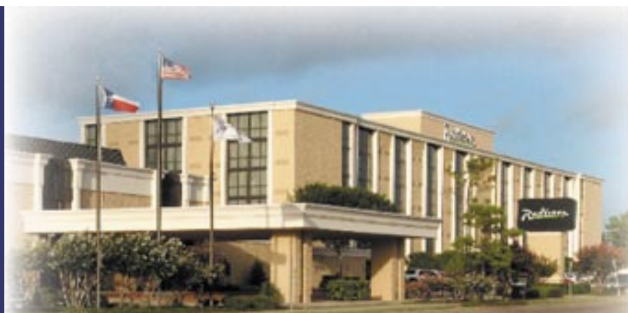
Radisson North, Fort Worth, Texas